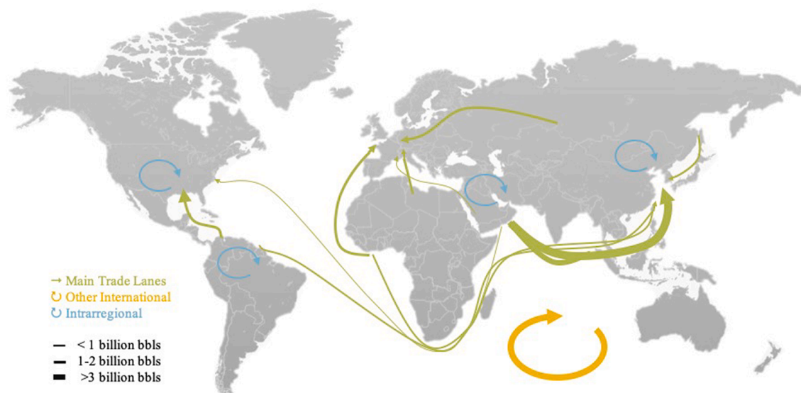
Fig. 1. Visualization of trade lanes Note: the width of the lines represents the approximate volume of oil that flows along the trade lane.

The results show that the main driver of emissions is distance, despite optimized loads and more energy efficient oil tankers. This suggests that efforts to reduce these emissions should be first directed towards increasing local shipments, rather than improving EVDI or loading factors. New maritime routes may lead to a reduction in oil transport emissions by decreasing the distance shipments need to travel subject to naval and commercial feasibilities ( ITF, 2019 ). Most significantly, the Kra Canal across the Malayan peninsula would shorten the Arabian Gulf to East Asia trade lane by 1,200 km. The Nicaraguan Canal and newly ice-free Arctic shipping routes may also